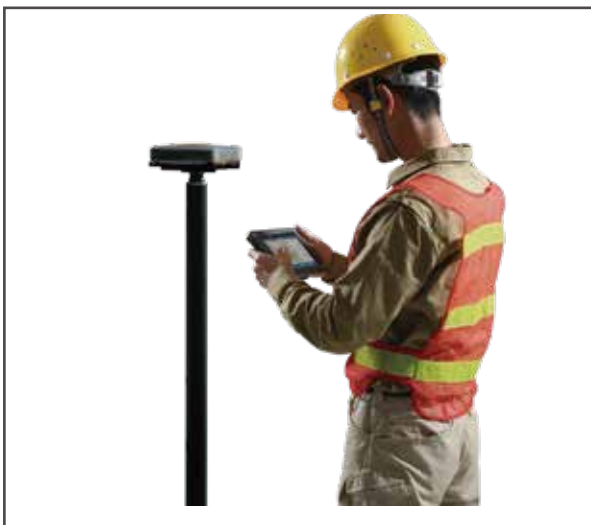
Working with Qbox8